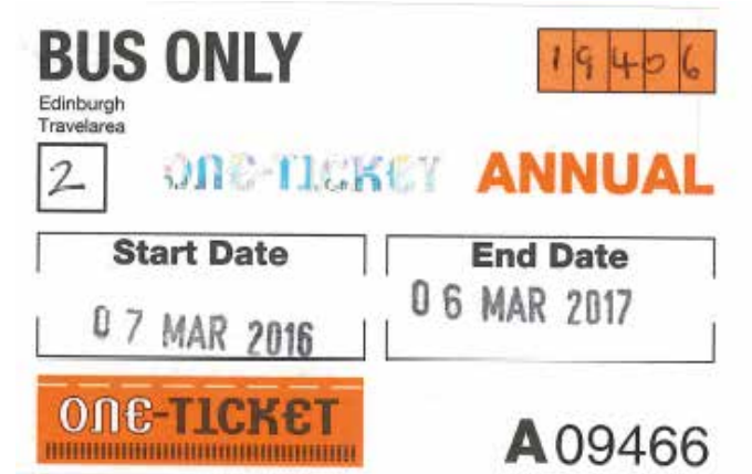
Photo ID Example: